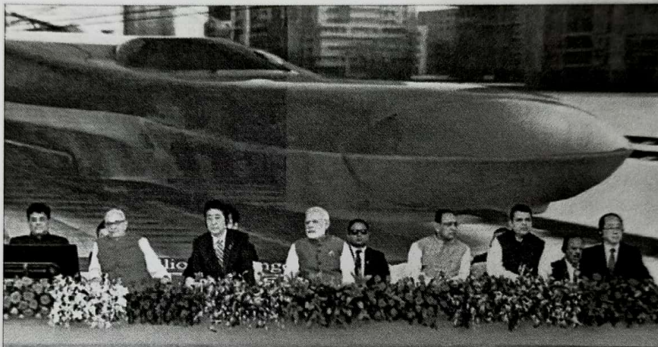
PM Modi and Shinzo Abe at groundbreaking ceremony of Mumbai-Ahmedabad High Speed Rail Project, in Ahmedabad, on Thursday

Modi, Abe lay foundation stone for A'bad-Mumbai bullet train project