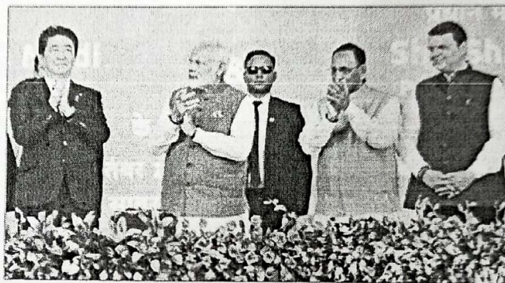
PM Narendra Modi, his Japanese counterpart Shinzo Abe, Gujarat CM Vijay Rupani and Maharashtra CM Devendra Fadnavis during the ground-breaking ceremony for the high speed rail project, in Ahmedabad on Thursday.

Prime Minister Narendra Modi and Japanese Prime Minister Shinzo Abe performed the 'ground-breaking' ceremony of the bullet train project in Ahmedabad.