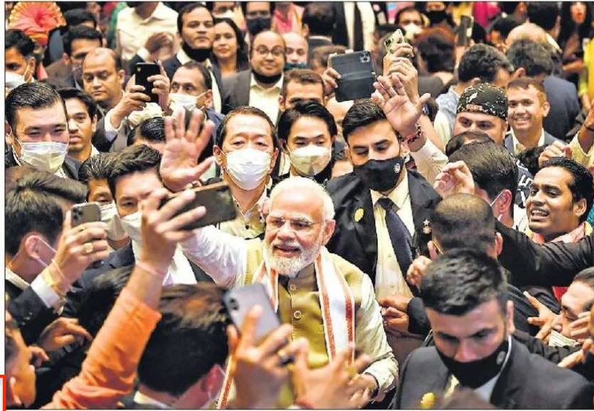
Members of the Indian diaspora greet PM Narendra Modi in Tokyo on Monday.

In line with the teachings of the Buddha, India is serving humankind and searching for solutions to global challenges such as the Covid-19 pandemic, which was the biggest crisis faced by the world in 100 years, Modi said. He highlighted socio-