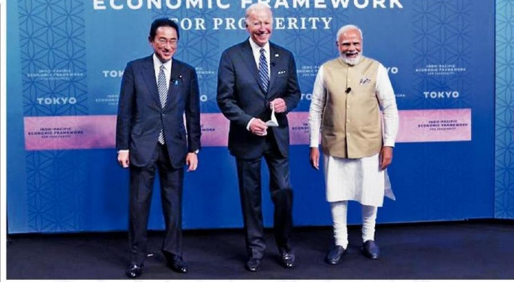
વડાપ્રધાન મોદી ક્વાડ શિખર પરિષદમાં ભાગ લેવા માટે જાપાન પહોંચી ગયા છે. વડાપ્રધાન નરેન્દ્ર મોદી, જાપાનના વડાપ્રધાન શુમિયો કિશિદા અને અમેરિકાના પ્રમુખ બાઈડેને ઈન્ડો પેસિફિક ઈકોનોમિક ફ્રેમવર્કના કાર્યક્રમમાં હાજરી આપી હતી.

India-Japan relationship of Buddha and Enlightenment The two countries have been connected for centuries: Modi