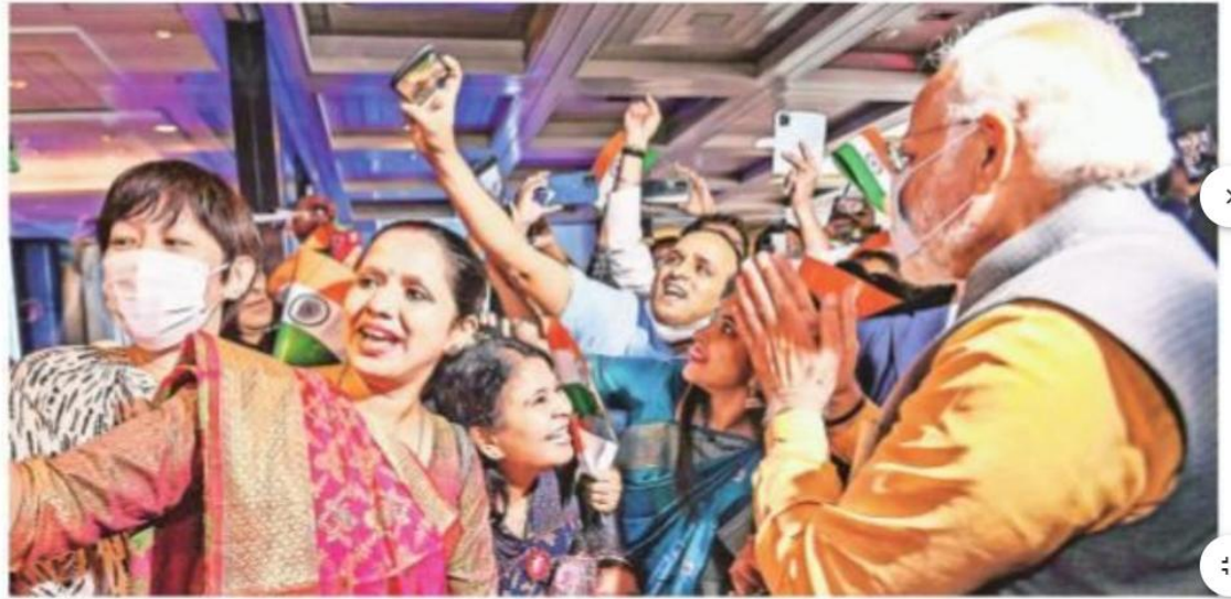
Prime Minister Narendra Modi with Indian expatriates in Tokyo on Monday.

Observing that India and Japan are natural partners, Modi said, "Japan has played an important role in India's development journey...our relationship with Japan is of spirituality, of cooperation, of