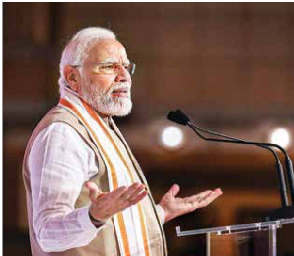
Prime Minister Narendra Modi addresses members of the Indian community during an event in Tokyo

“India and Japan are natural partners. Japan has played an important role in India’s development journey,” said