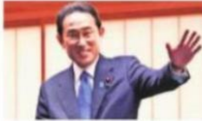
Japanese PM Fumio Kishida on Tuesday.

The two leaders had a productive exchange of views on enhanc-